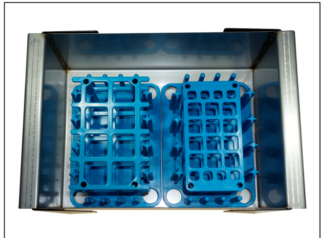
Two IEC test tube racks CH3989-401 or CH3989-601 fit nicely inside the Water Bath.