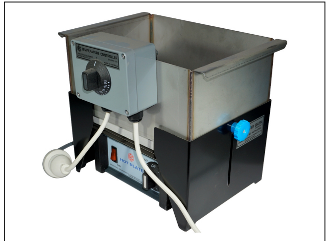
View showing the temperature sensor fitted and connected