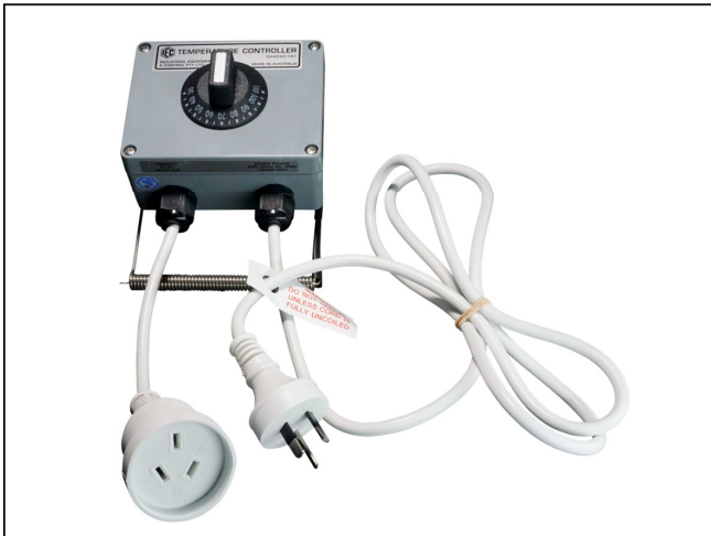
View of the temperature controller CH4240-101 Must be purchased separately