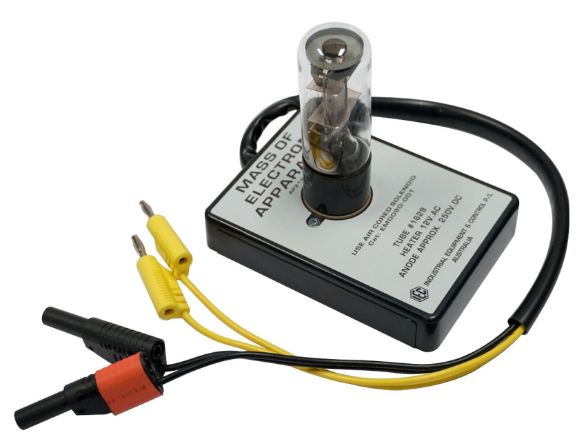
AP2120-001 Mass of Electron