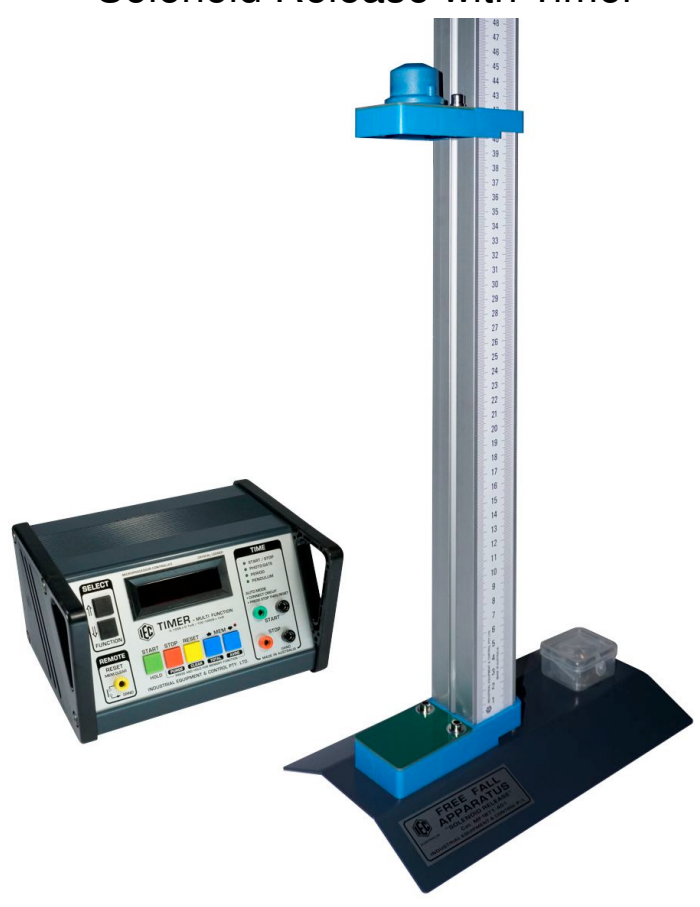
MF1871-401A (1.0m Fall, Solenoid Release, with LB4064-101 Timer)