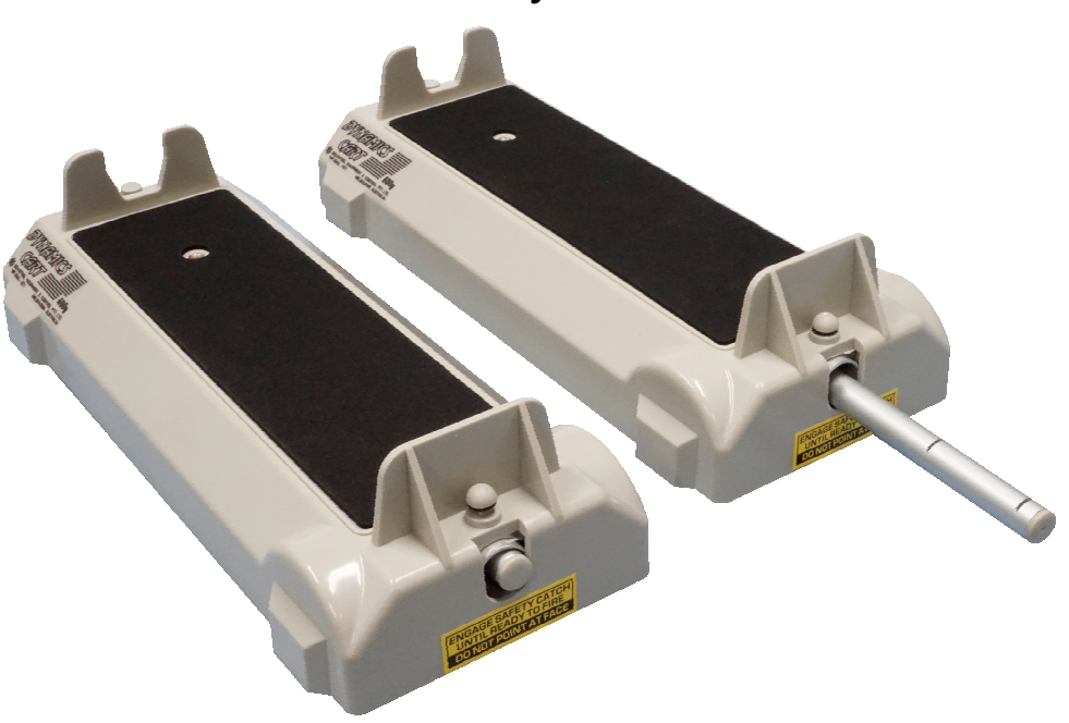
MF0945-001 Dynamics Carts (pair)

The IEC 'Dynamics Carts' have the following special features: